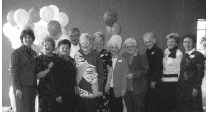
The Service League relaxes for a picture at the end of last year's luncheon & now they are hard at work planning the next one.

The forecast calls for snow, it's 20 degrees outside and there's still another month and a half until spring arrives! However, there is hope for warmth and sunshine in the days ahead and you can look forward to attending the 12 th Annual Spring Luncheon, hosted by the ladies of the Share Foundation Service League. The Luncheon will take place on Wednesday, April 9 th , at 11:30 a.m. at the Halls of St. George in Schererville. A fabulous spring day awaits you, featuring delicious food, wonderful prizes, and good company all for the price of $25! The dedicated members of the Service League promise another great event that you will be sure to enjoy.