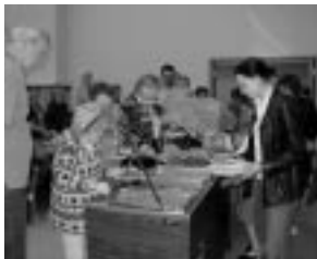
Guests helped themselves to the fabulous buffet.