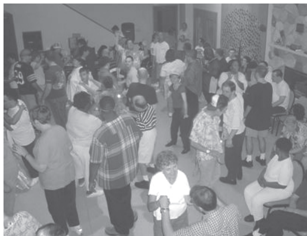
Dances at mini camp are always popular

Letters are being sent to current and former staff inviting them to participate. A response sheet will be included for you to indicate which months you are available to serve. If you haven't volunteered at Camp Sharing Meadows before, this is a great time to begin! Call Sandy at 219-778-2585 and she will be happy to answer your questions and send you information so you can be part of this special experience.