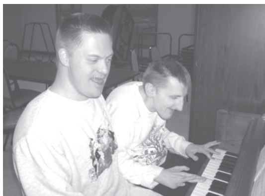
Camp brings out the musician in all of us!