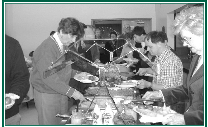
St. Patrick's Day 2008

Adults are just $10 and children under 17 are free when accompanied by their parents or grandparents. Money can be sent to the Share Foundation office or you can pay at the door.