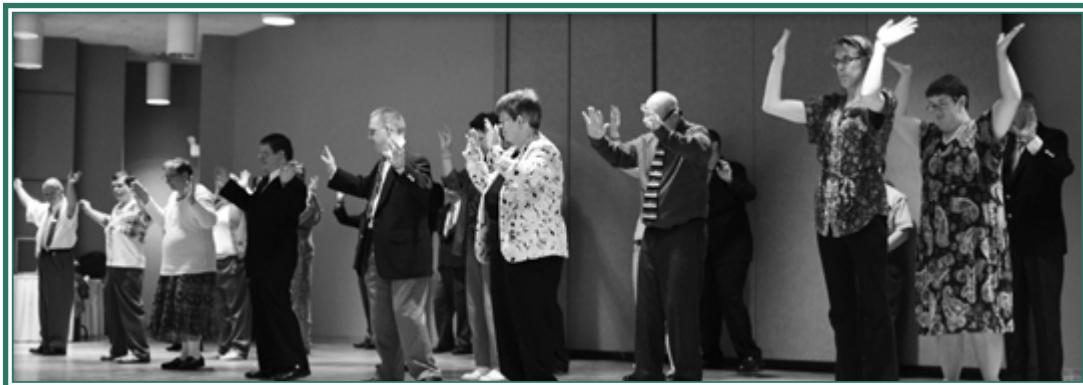
The villagers will entertain you with a lively dance routine

We are practicing our dance routines and making table prizes for the upcoming Spring Luncheon on Wednesday, March 20 th at 10:30am in the Halls of St. George, 905 E. Joliet, Schererville (219.865.9411). The cost of this fundraiser is $35/person for a delicious chicken lunch.