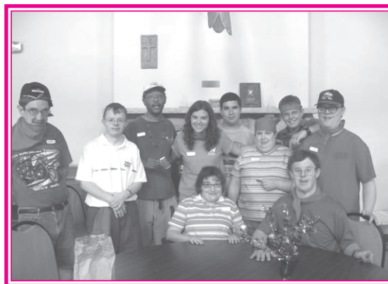
Camp is a time for friends!