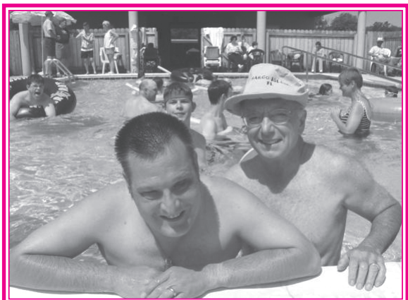
What a great way to spend a hot summer afternoon - in the pool!

This month camp will take place on April 13, 14 and 15 and we will celebrate spring with the theme of "We harvest new life by