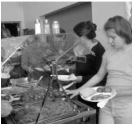
Our guests enjoyed the delicious food