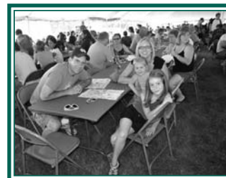
Put your family in this picture and have a great time with us!

Our chefs are working on their prize winning food for your culinary enjoyment and the Irish bands are ready for lively performances and all we need is you. Tickets will be mailed to past attendees next month and we look forward to welcoming all of you to Sharing Meadows on Sunday, August 7 th !