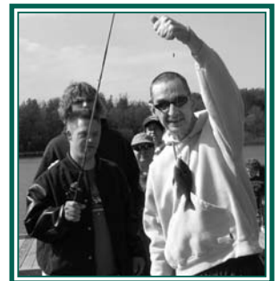
Fishing is one of the many activities enjoyed at camp