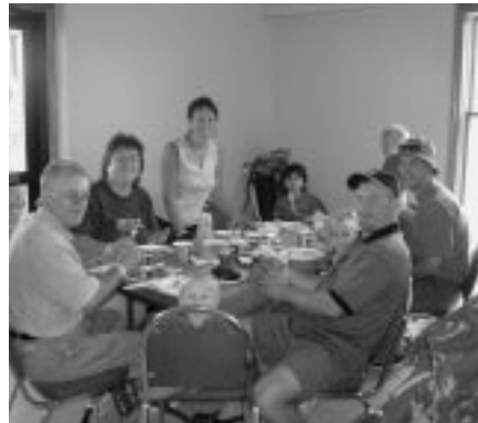
This family enjoys their meal inside the St. Timothy Center