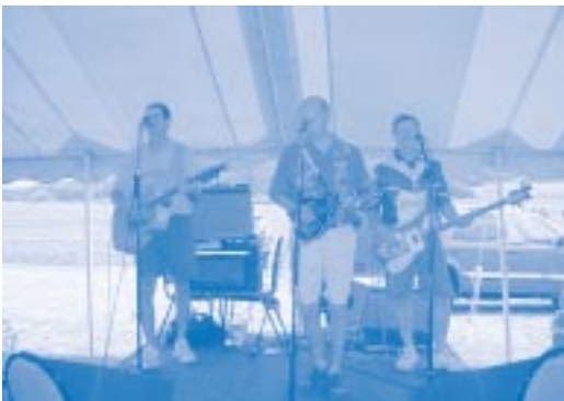
St. James Gate entertained the crowd with their festive Irish Tunes.