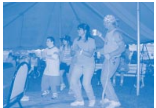
The rain didn't stop this group from having fun dancing under one of the tents!