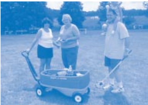
The Leprechaun Hunt is fun for the entire family!