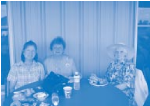
These 3 ladies enjoyed the Leprechaun Hunt from a table on the porch of the St. Timothy Center.

We are looking forward to celebrating the 10 th Annual Leprechaun Hunt© with you and your family!