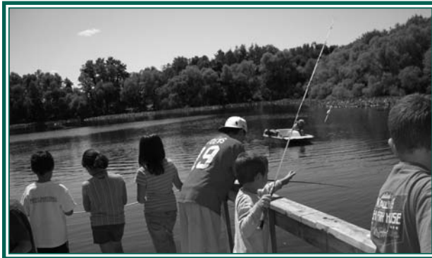
Fishing on Tucker Lake