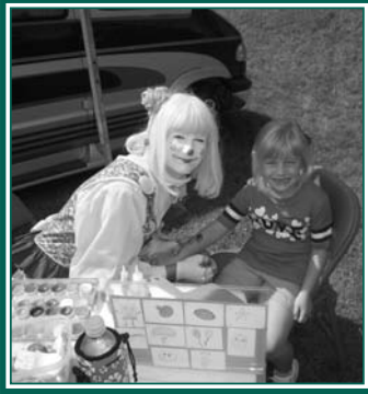
Artistic clowns will paint pictures on our wee guests