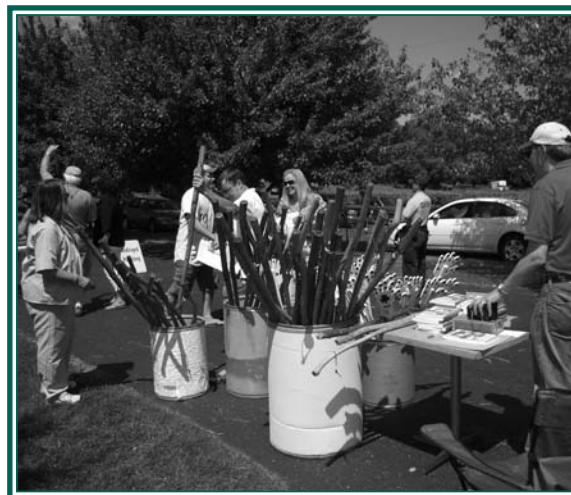
You can buy a divining rod to help you find a leprechaun