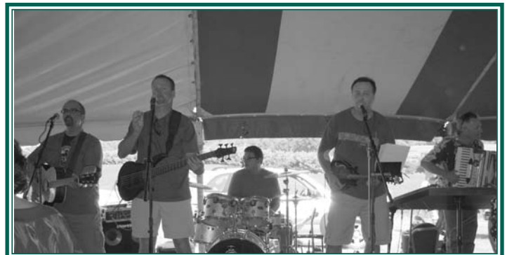
New Element will entertain you with delightful Irish music