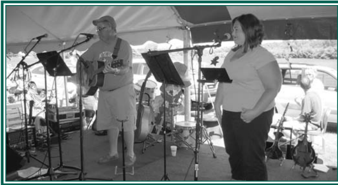
The Doolin Clan will be back for an encore performance