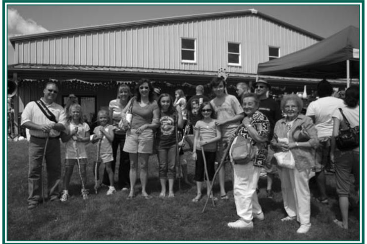
A day for families!

A few years ago one of the villagers adamantly announced that he wasn’t working the day of the Leprechaun Hunt© because “it’s too hot.” While I admired his courage in speaking his mind, I also realized I needed to get him back on board before the other villagers decided to follow suit. I looked at him and told him that was okay but he needed to realize that the Leprechaun Hunt© raises money to fund the