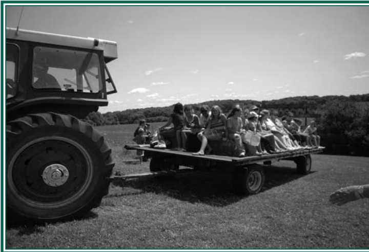
Hay wagons will take you around the grounds of Sharing Meadows

residential program at Sharing Meadows so if he didn’t help, we probably wouldn’t make as much. I went on to explain that we’d have to cut down on expenses so we wouldn’t be able to drive the van as often since gas costs money and we might have to eat a little less and certainly use the air conditioning in the homes less and less. He thought for a second or two and announced that he was going to work after all. And work he did, along with his fellow villagers before, during and after the event, and always with a smile and determination to get the job done.