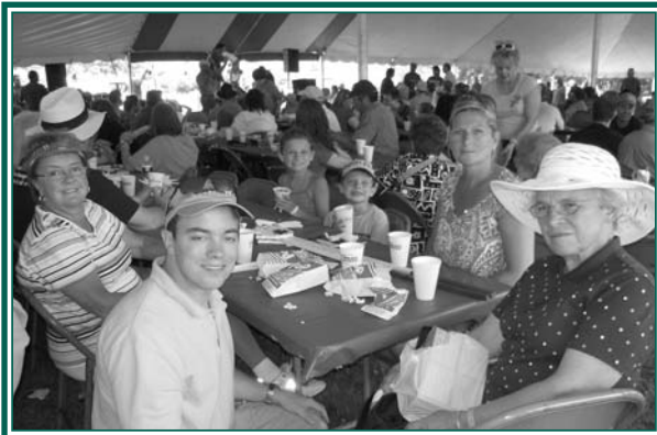
Three generations of the Collins family enjoy the Leprechaun Hunt