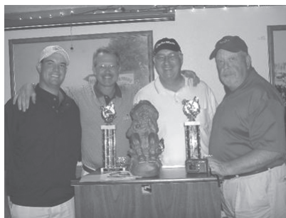
Golfers of the Day 1st place team from Indiana Institute of Cardiology accept their trophies