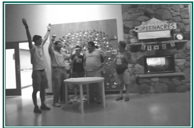
Skits are performed by each color group

Summer camp 2009 is but a memory but what a great memory it is! For six weeks, the St. Timothy Center Camp Building was filled with friendship, music, activity and joy! The days of camp were filled with swimming, fishing, dancing, arts & crafts, games, campfires, and plenty of good food. Entertainers came to perform and horses came each week so the campers could ride and pet them. Most importantly, the values session, led each day by camp coordinator Sandy Furman, centered around the theme of "Forgiveness" and each person at camp participated and shared their stories of the peace that comes from following Christ's example by forgiving others.