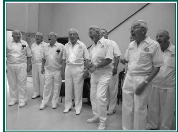
The Hoosier Grandpas entertained with song

Summer camp 2009 is but a memory but what a great memory it is! For six weeks, the St. Timothy Center Camp Building was filled with friendship, music, activity and joy! The days of camp were filled with swimming, fishing, dancing, arts & crafts, games, campfires, and plenty of good food. Entertainers came to perform and horses came each week so the campers could ride and pet them. Most importantly, the values session, led each day by camp coordinator Sandy Furman, centered around the theme of "Forgiveness" and each person at camp participated and shared their stories of the peace that comes from following Christ's example by forgiving others.