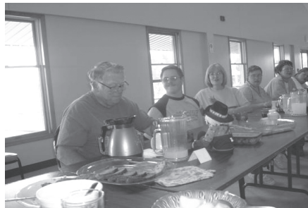
Eating High off the Hog at Community Meal

Since then, they've gathered together many times for cookouts in the gazebos where they've dined on barbecued ribs, pork chops and bratwurst. I've heard that breakfast is better than ever in the villages these days when bacon or sausage is served in addition to the scrambled eggs. The main dish at our community meal a few weeks ago was baked ham and it was tender, juicy and delicious! What a treat both that day and the next when ham sandwiches were on the menu for lunch and a pot of ham and bean soup was simmering on the stove!