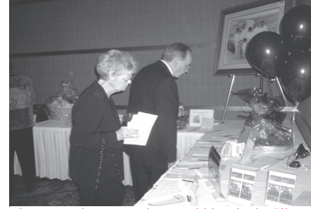
Our guests have many items to bid on in the Silent Auction